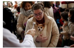
Animals being blessed in Madrid