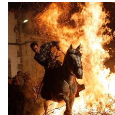
Horses riding through flames